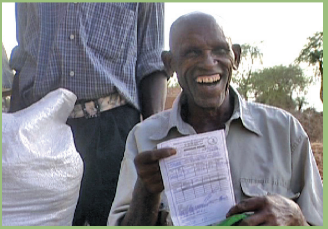
You will get a receipt, and will be paid quickly when you join a group.

For more information, SMS ‘GROUPS to 30606