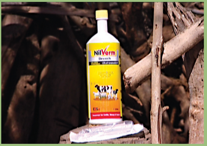
Make sure your livestock has no worms by deworming every 3 months.

It is important to deworm your livestock so they grow better. Use a dewormer like Nilverm. Always dose according to the instruction on the label. You should deworm your goats before the dry season, and then every 3 months.