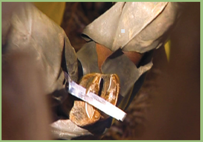
Trimming your goats hooves means they will be able to find more food

For more information, SMS ‘LIVESTOCK’ to 30606