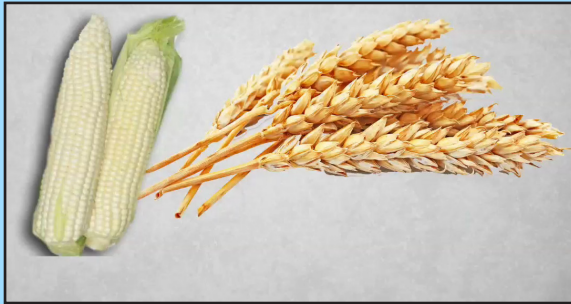
From maize, maize bran, wheat bran.