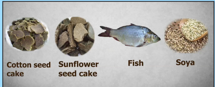
Cotton seed cake