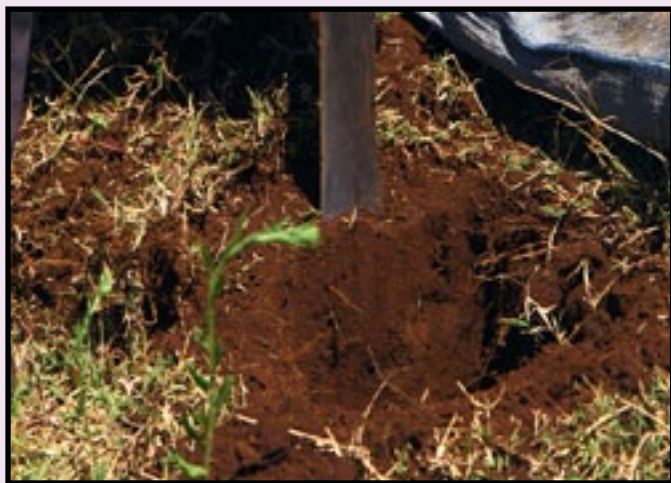
Take a slice from the sides of the hole using a panga or a soil auger