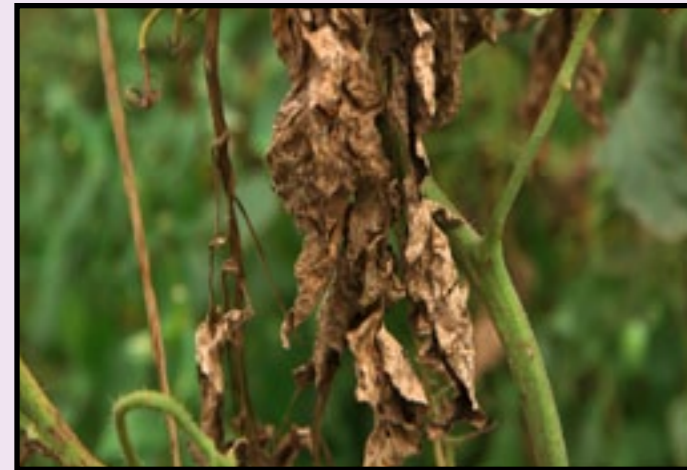
Tuta absoluta burns the whole crop

For more information SMS 'TOMATOES' to 30606