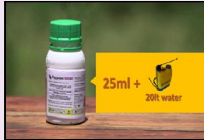
Spray with Pegasus to stop Tuta absoluta