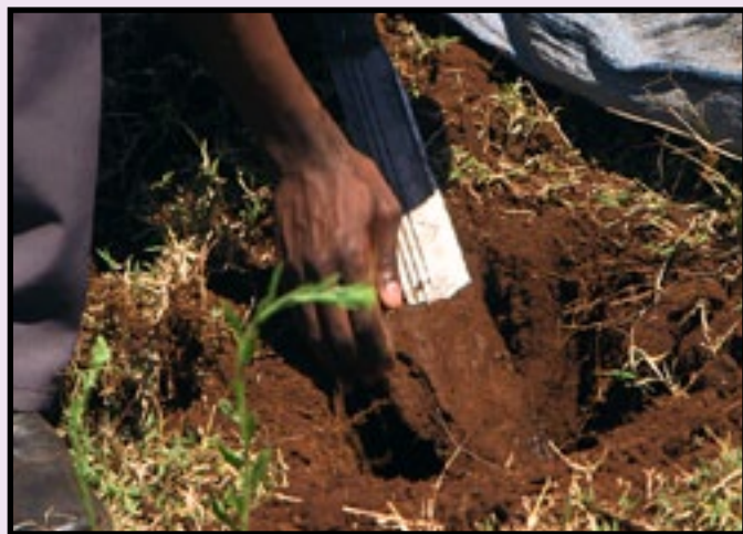
Add the soil to a labelled bag and either post or give to a Soil Cares representative