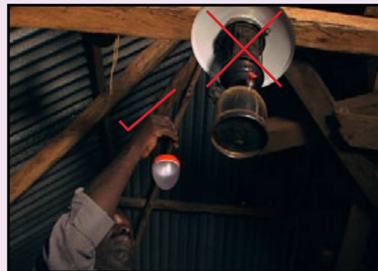
Hang the solar bulbs in your house to see well

You can use it to charge your phone and your neighbours can pay you to charge their phones.