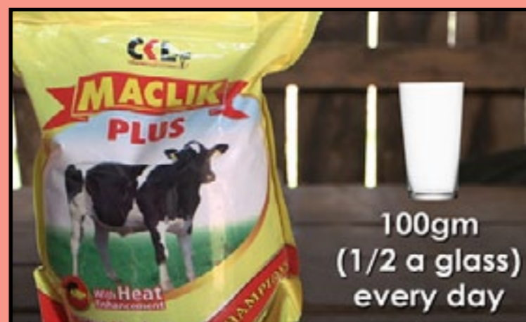
Give Maclik Plus to make cows come on heat and become pregnant easily

Keep good breeding records to know when to expect the calf and to serve your cow next time.