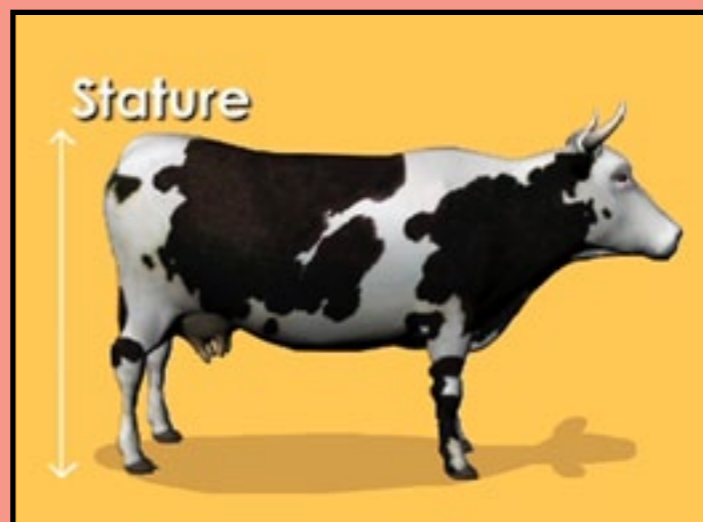
Serve your cow when on heat using a bull with an average stature