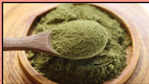
Superfood for Superhealth