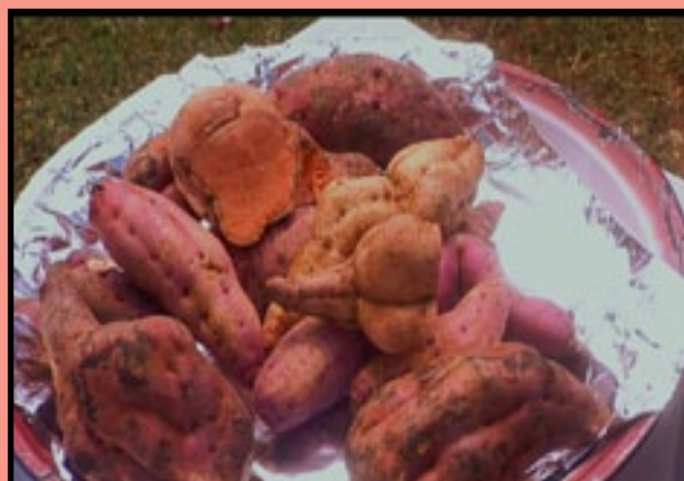
OFSP are good for children and pregnant women

Another good way of making your family eat healthily is by eating orange fleshed sweetpotatoes (OFSP). They are very rich in vitamin A, which is good for children and pregnant women.