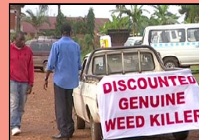
Do not buy chemicals from an unlicensed car or boda boda