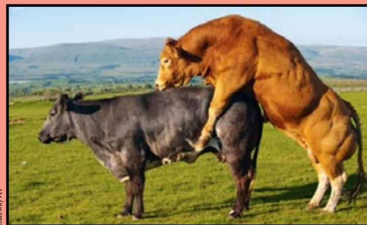
Cows on heat stand if mounted

To make your cow come on heat on time and get pregnant easily: