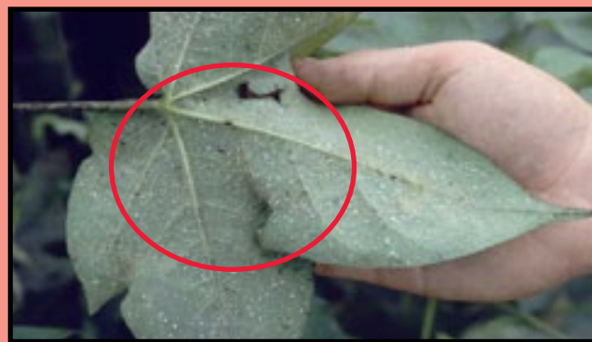
Whitefly is a small, white insect found under leaves

Do not grow crops of the same family every year. Rotate your crops to stop pests and diseases building up.