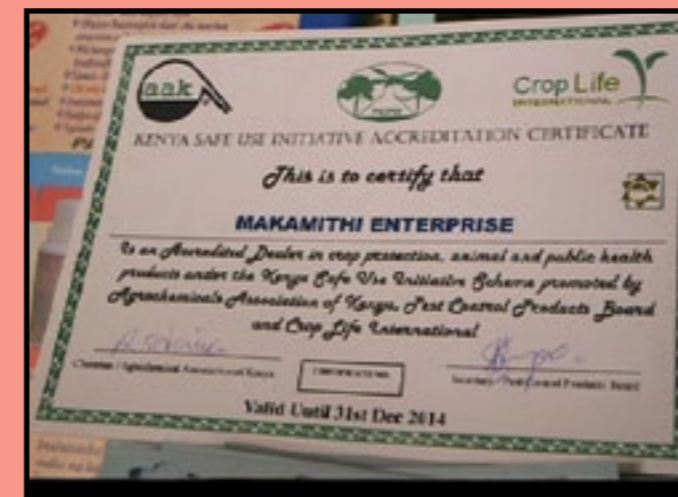
Good shops have an accreditation certificate