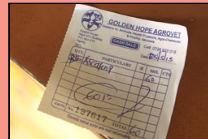
Get a receipt for any chemicals you buy