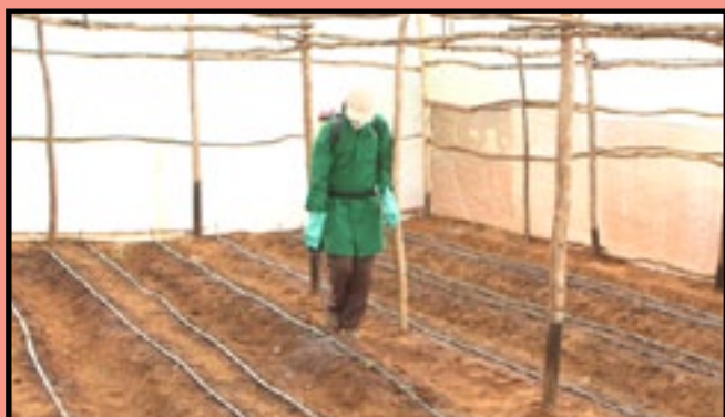
Drench with Actara to stop whiteflies

For more information, SMS 'TOMATOES' to 30606