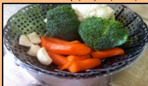
Steaming vegetables will keep them nutritious