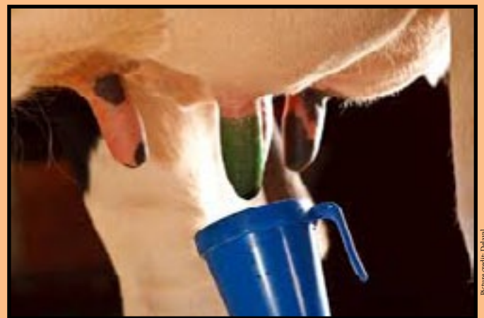
Dip each teat into the Teat Dip solution