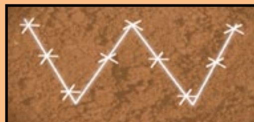
Take soil from 20 points using a W/ zigzag shape