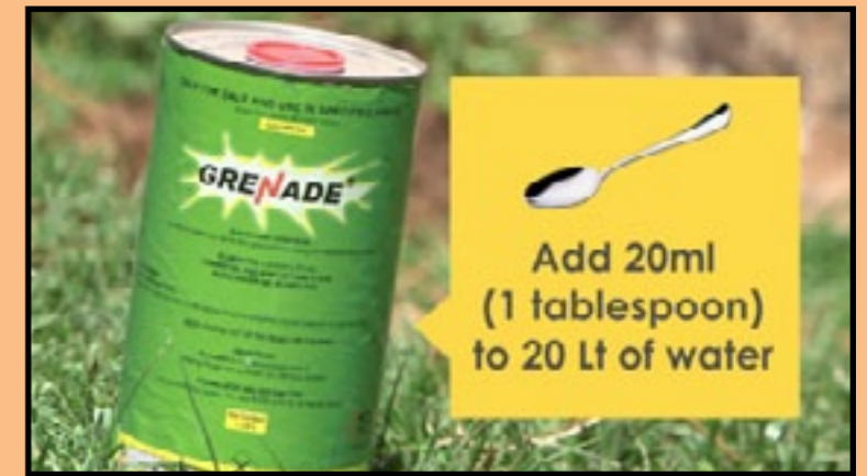
Mix 1 tablespoon of Grenade in 20 litres of water

For more information, SMS 'COWS' to 30606