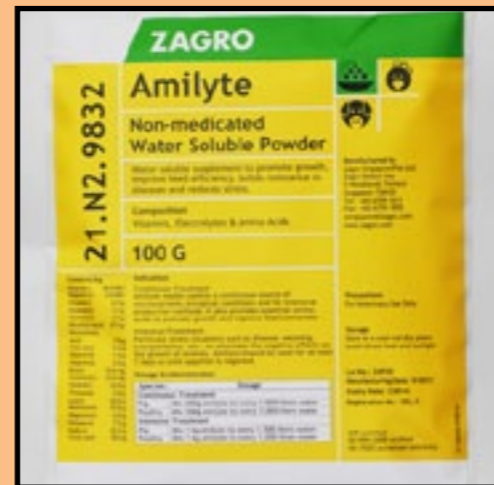
Amilyte vitamin supplement makes birds less stressed