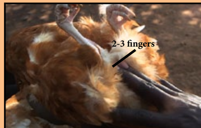
If less than 2 fingers fit between the pelvic bones, it is a bad layer