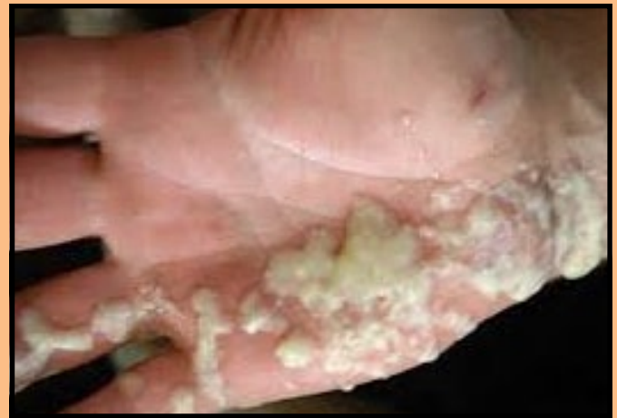
Milk with mastitis is watery, has solids and blood stains when you check using your hand