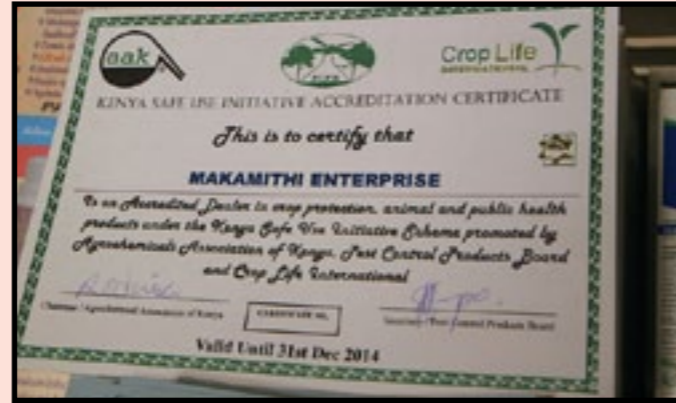
A valid accreditation certificate from AAK