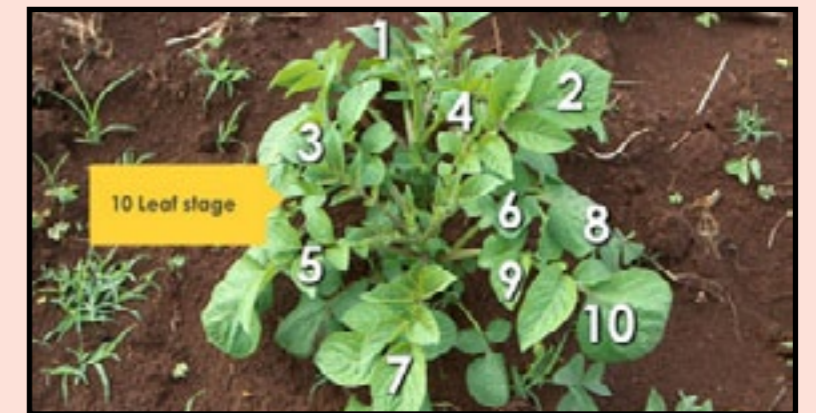
After 6 weeks or when the plant has 10 leaves, spray with the 10 Leaf Stage Pack to get better growth

Each Viazi Power Programme pack is enough for 1/2 an acre. Wear goggles, mask, overalls and gumboots when spraying chemicals.