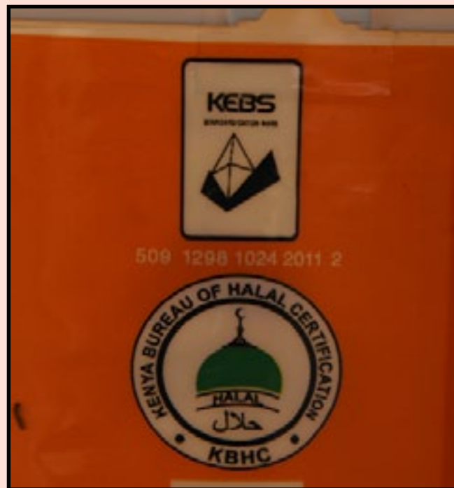
Get a certificate from KEBS to sell to supermarkets and bigger buyers