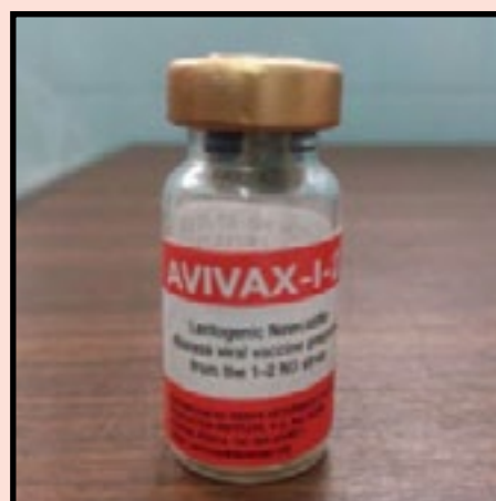
Use Avivax in Kenya to vaccinate against NCD

For more information, SMS 'CHICKENS' to 30606