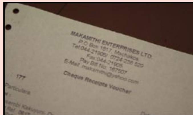
Get a receipt for chemicals you buy