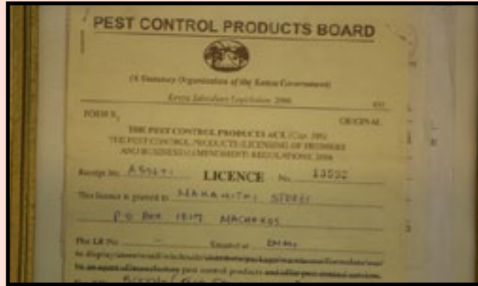
A PCPB license