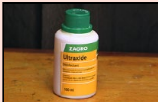
Use Ultraxide to disinfect the house