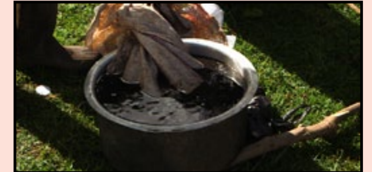
Soak the seeds for 6 minutes then drain