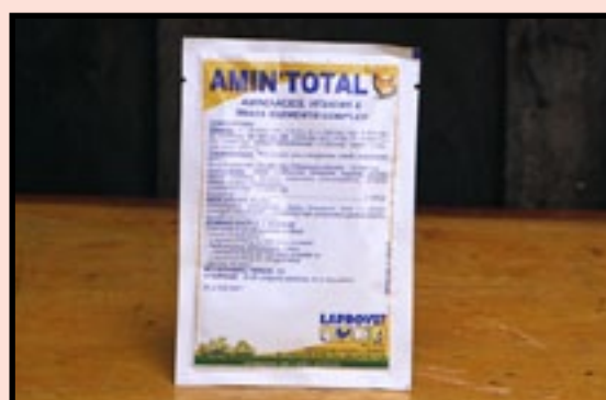
Amintotal makes your chickens grow fast and strong