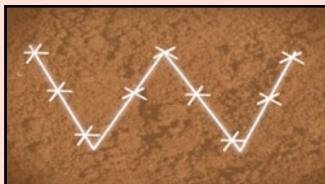
Take soil from different places across the shamba in a W/zigzag shape

For more information, SMS 'SOIL TEST' to 30606