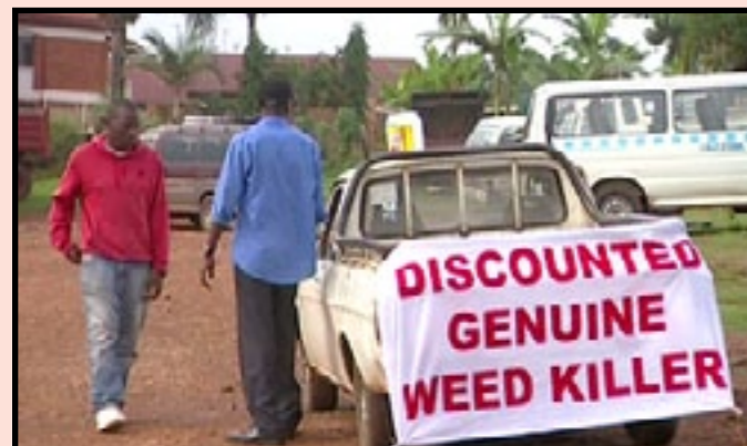
Do not buy chemicals from the side of the road