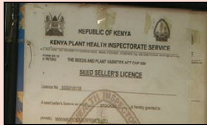
Licensed distributors must have a certificate to sell