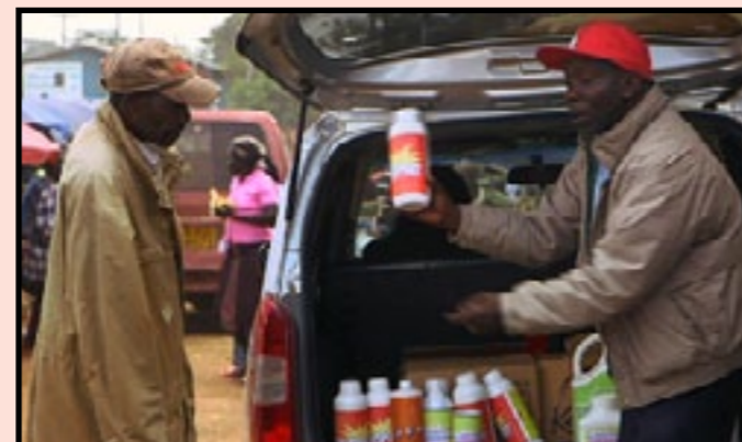
Or buy chemicals from a seller who cannot give you a receipt with an address and contact number