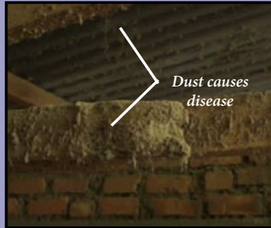
A dusty roof will spread disease