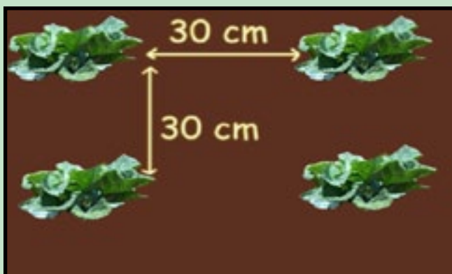
Plant cabbage seedlings 30cm apart

SMS your name & county to 20727 to find out when SoilCares will be in your area! eg. Katharine Gichinga, #Nairobi, 3 acres, MAIZE.