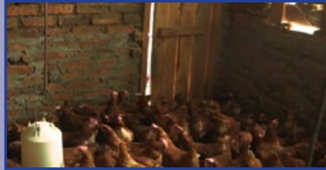
Chickens huddling by a door or window need more clean air