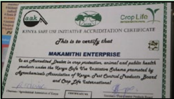
Ask for the accreditation certificate before buying