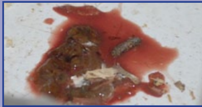
Red diarrhoea is a sign of Coccidiosis