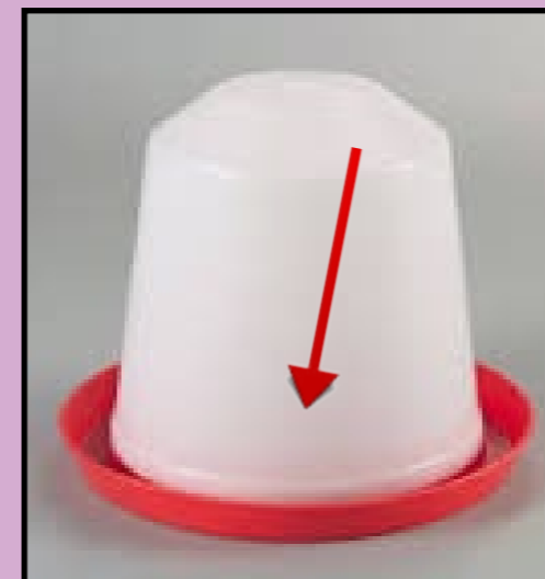
Mix Gumboro vaccine with drinking water