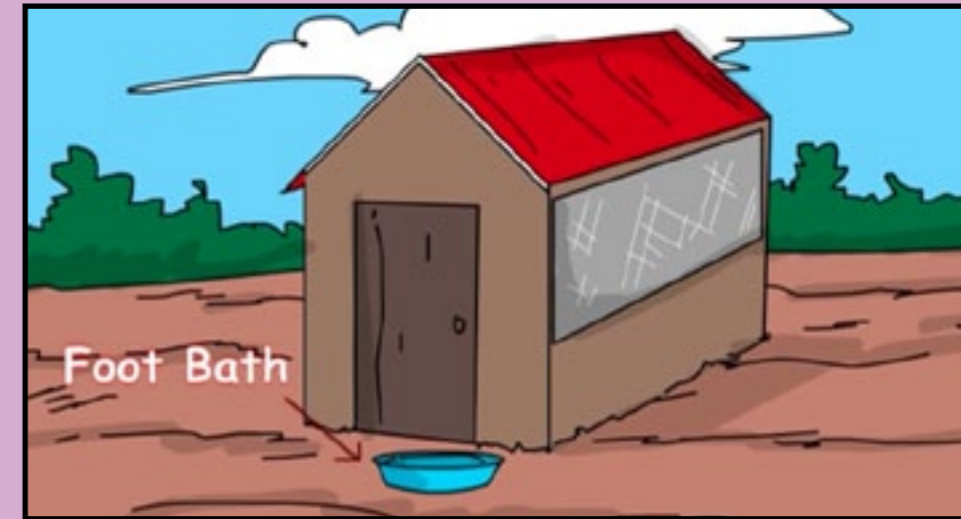
Put a foot bath in front of your chicken house to stop disease