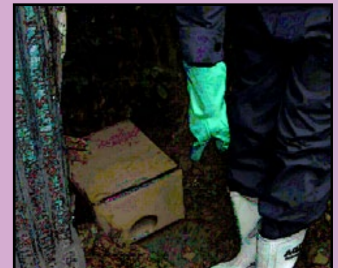
Place the box where rats pass

For more information SMS 'CHICKEN' to 30606