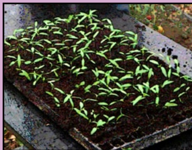
Seedlings are ready for transplanting after 7 days

For more information SMS 'VEGETABLES' to 30606