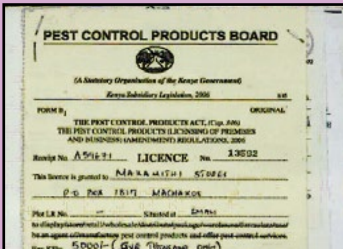
A sample pest control license with a product number