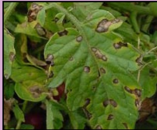
Pests and diseases can stunt your tomato crop