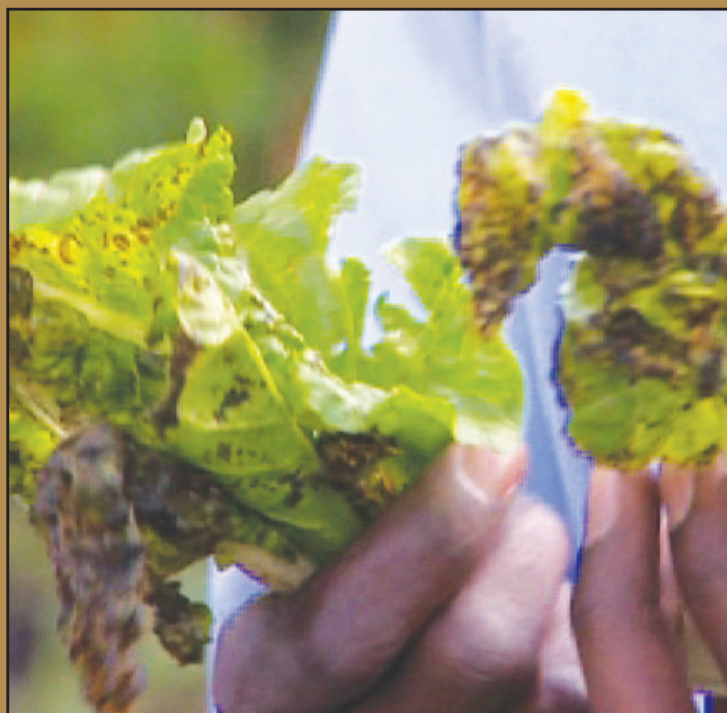
Blackspot looks like this.

Always remember to wear protective clothing, gloves and a mask when spraying chemicals!