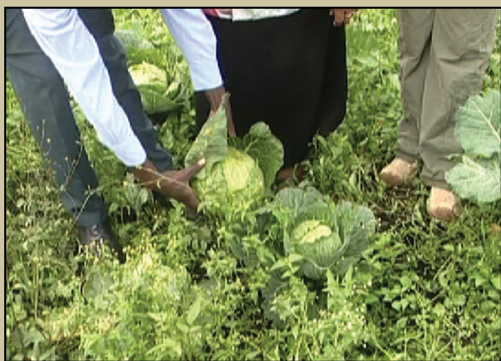
Hybrid seeds (left) can give you bigger cabbages than normal seeds (right).