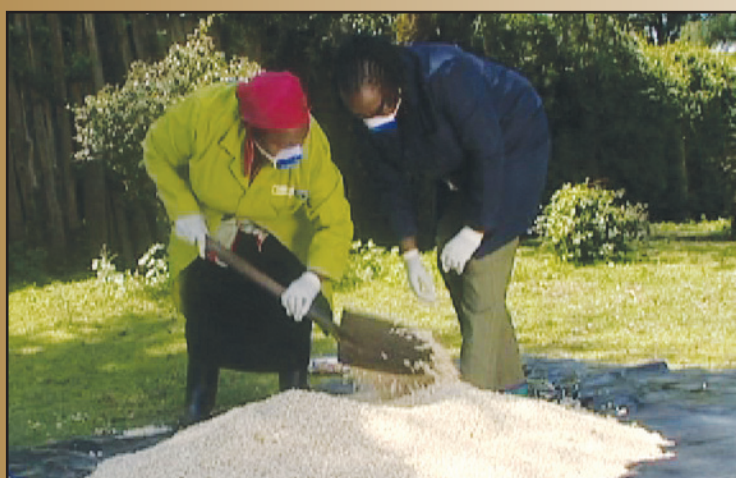
Mix the dawa well with the maize – and remember to wear protective clothing.

To do this, use 50g/5 tablespoons of Actellic Gold for 90kg of grain. Mix the Atelic Gold with the maize and mix slowly, covering it well. Always store maize away from the wall and out of reach of children.