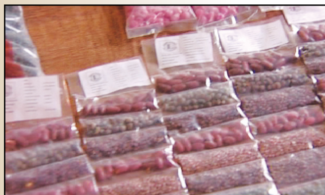
Leldet sells seeds in small packets so you can afford them.