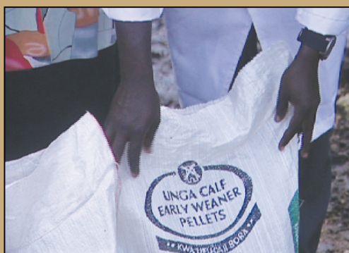
Early Weaner Pellets.

1 – 3 weeks. Helps the calf grow faster. Helps the calf gain weight.