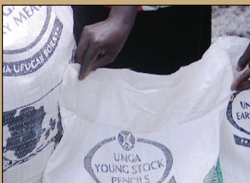
Young stock pencils.

3 – 15 months. Helps them reach a target weight. Helps reach maturity for calving.