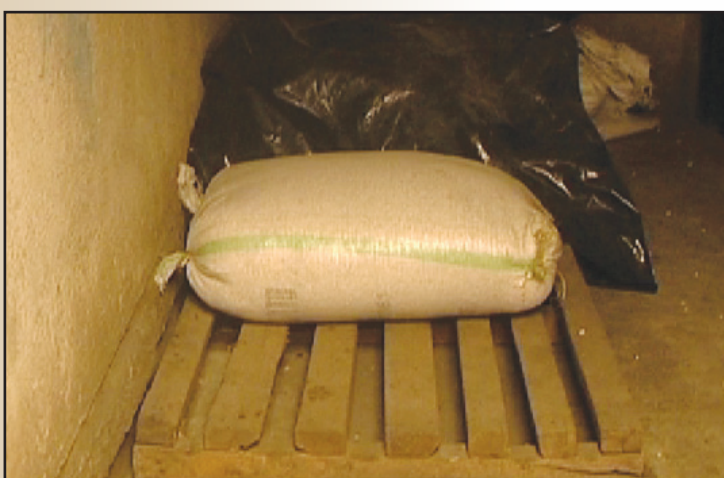
Store maize in sacks off the floor away from people.